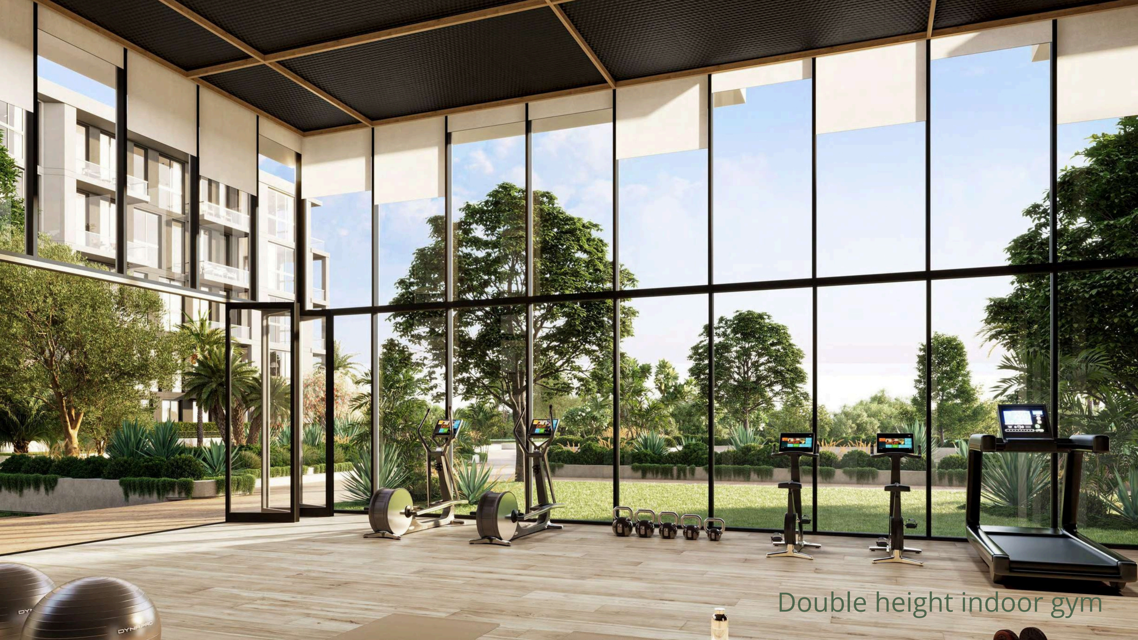
Double height indoor gym