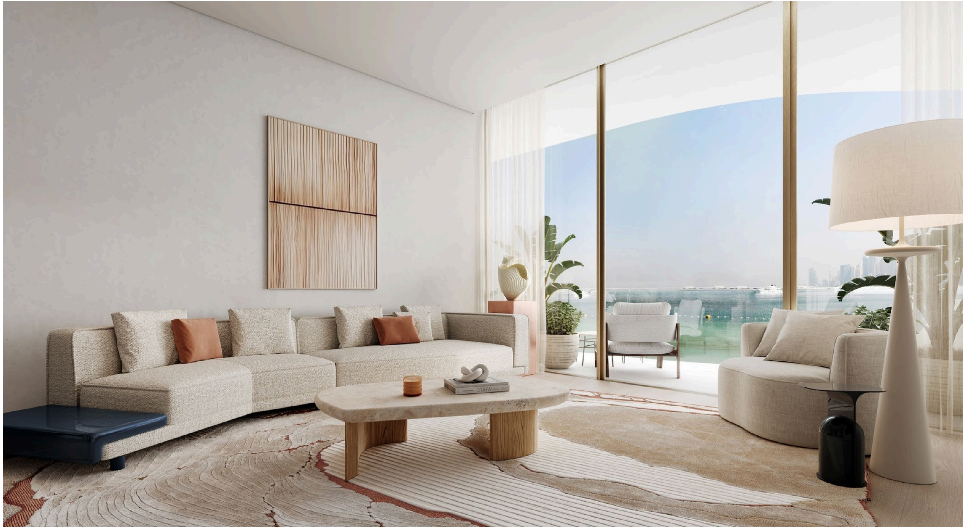
A space to indulge in moments of relaxation and comfort