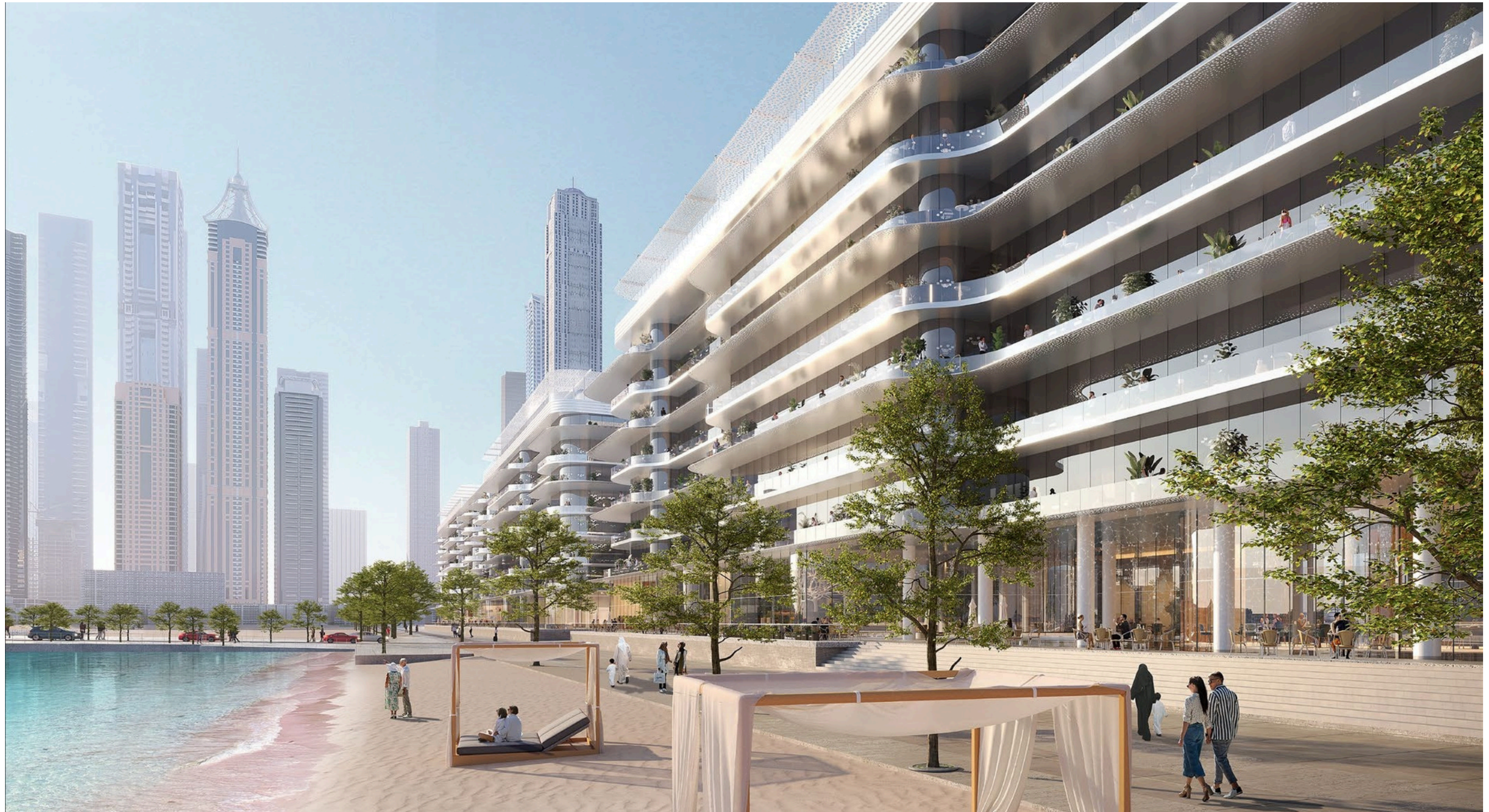
Dubai Harbour Residences provides instant access to the beach