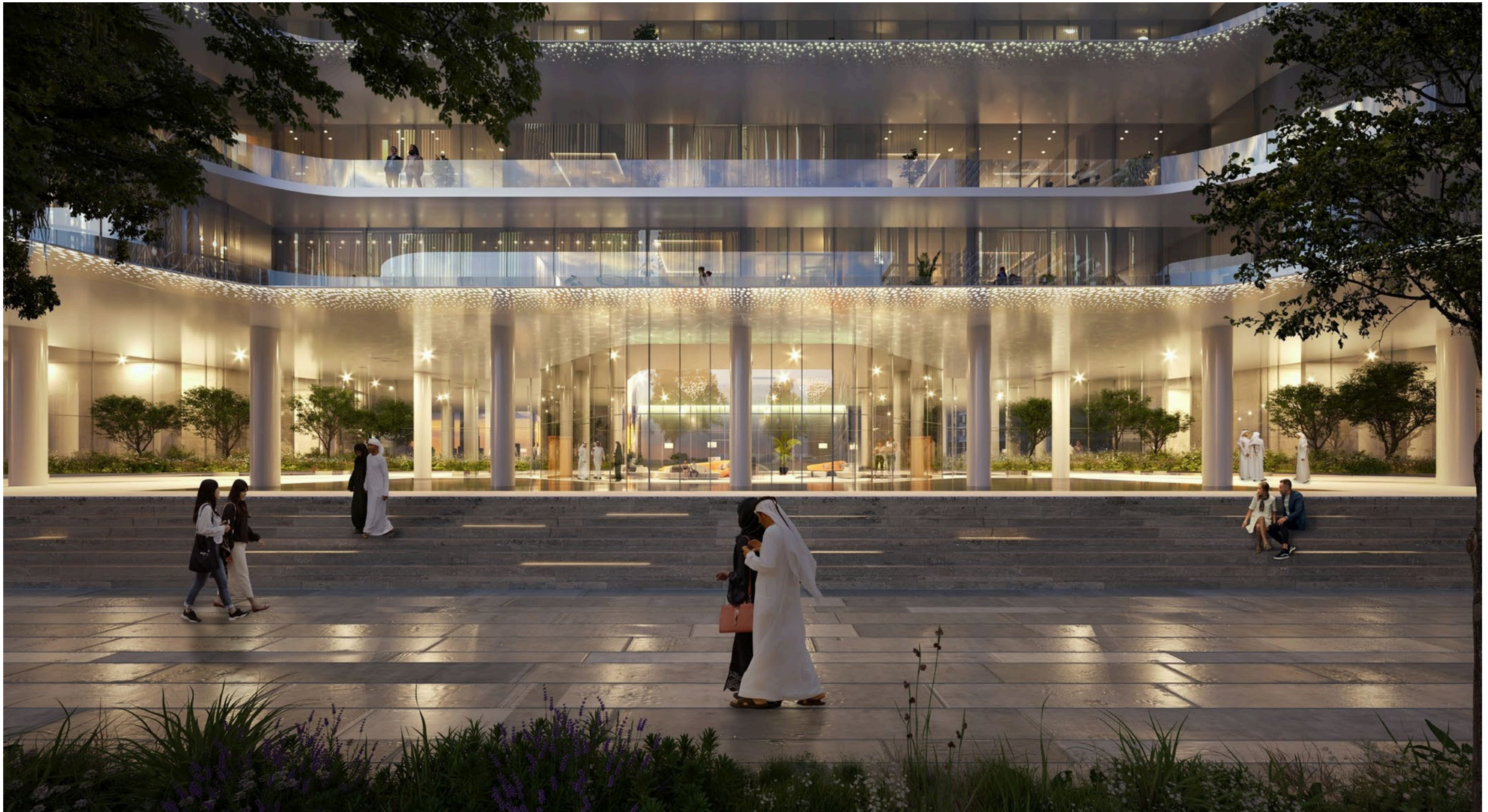
Glass façades, large terraces, and epic panoramas create an expansive sense of space