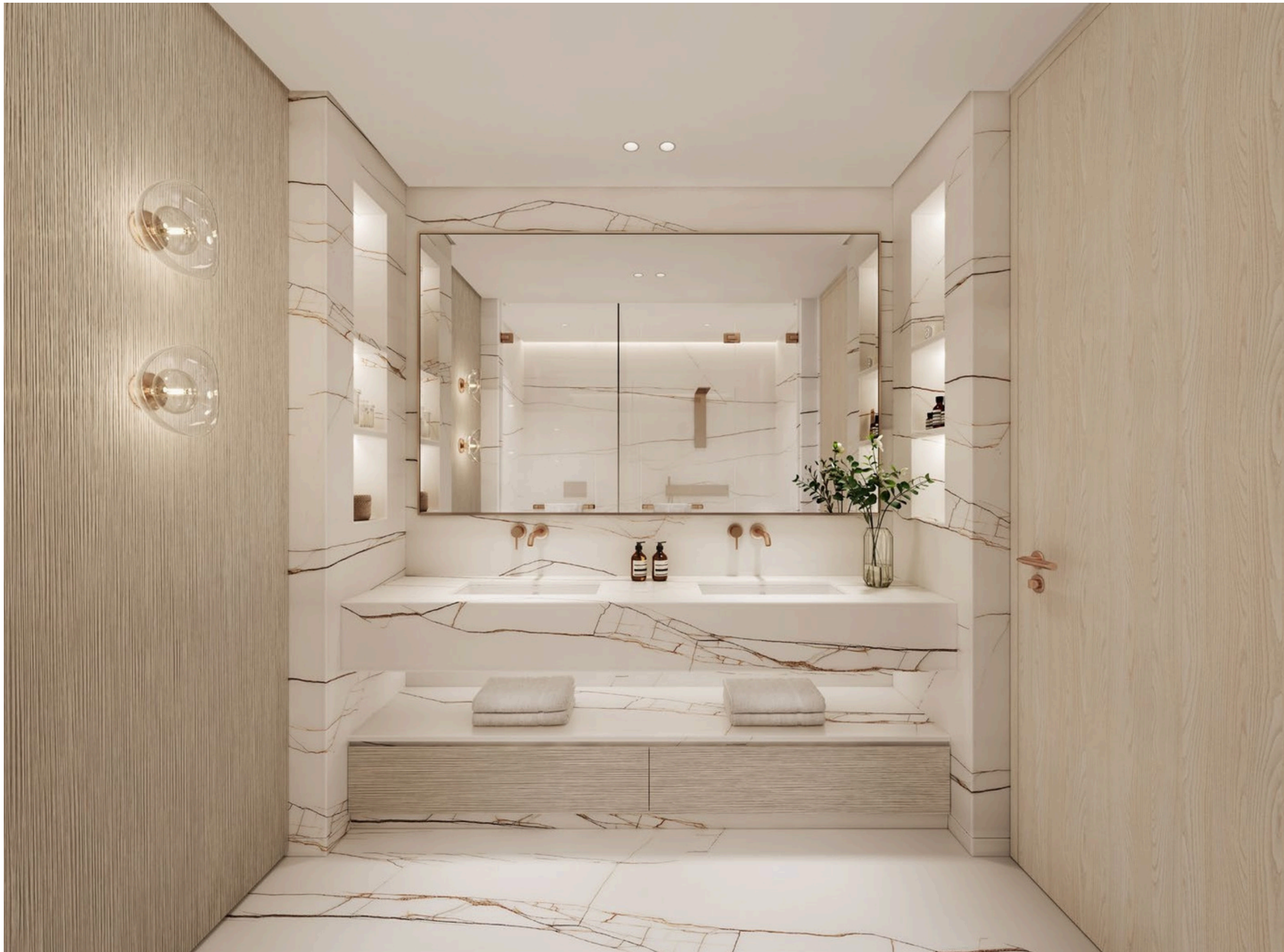
Bathrooms adorned with impeccable textures and fine finishes