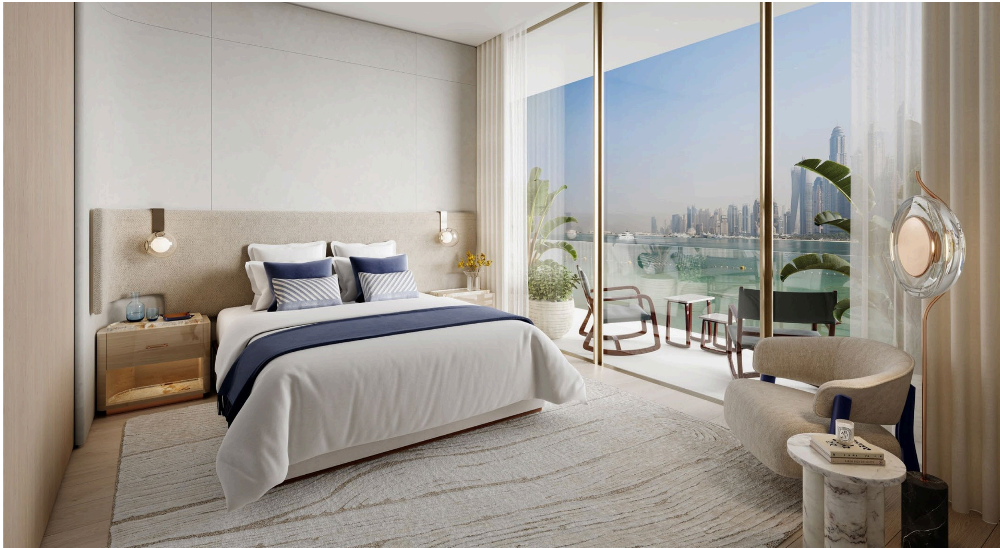
Panoramic bedroom views of the sands, sea, and city