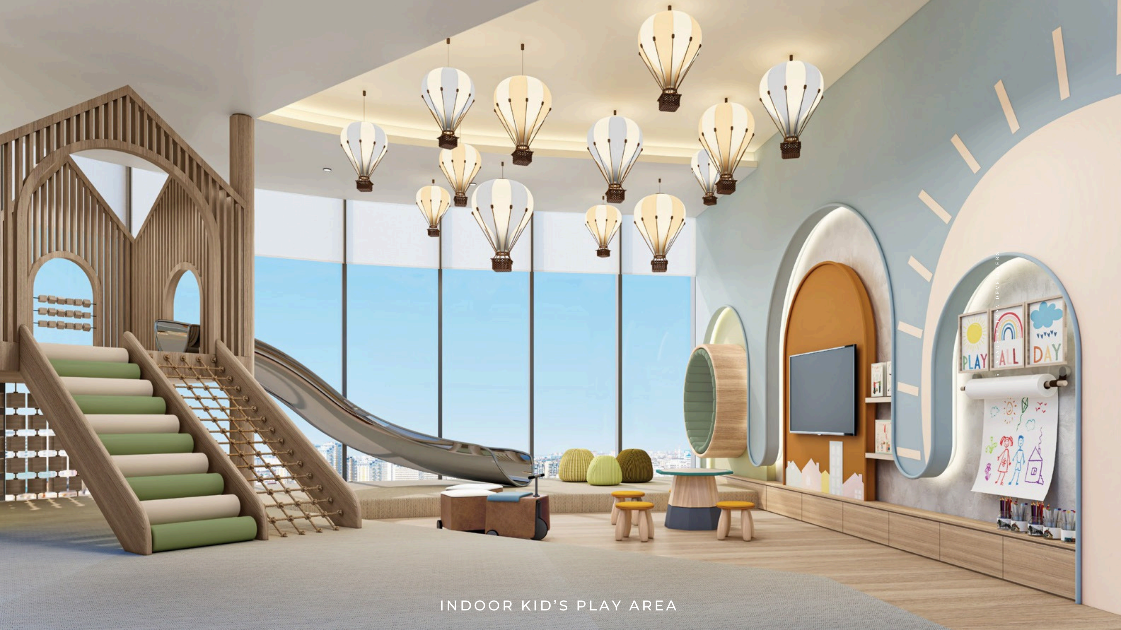
INDOOR KID'S PLAY AREA