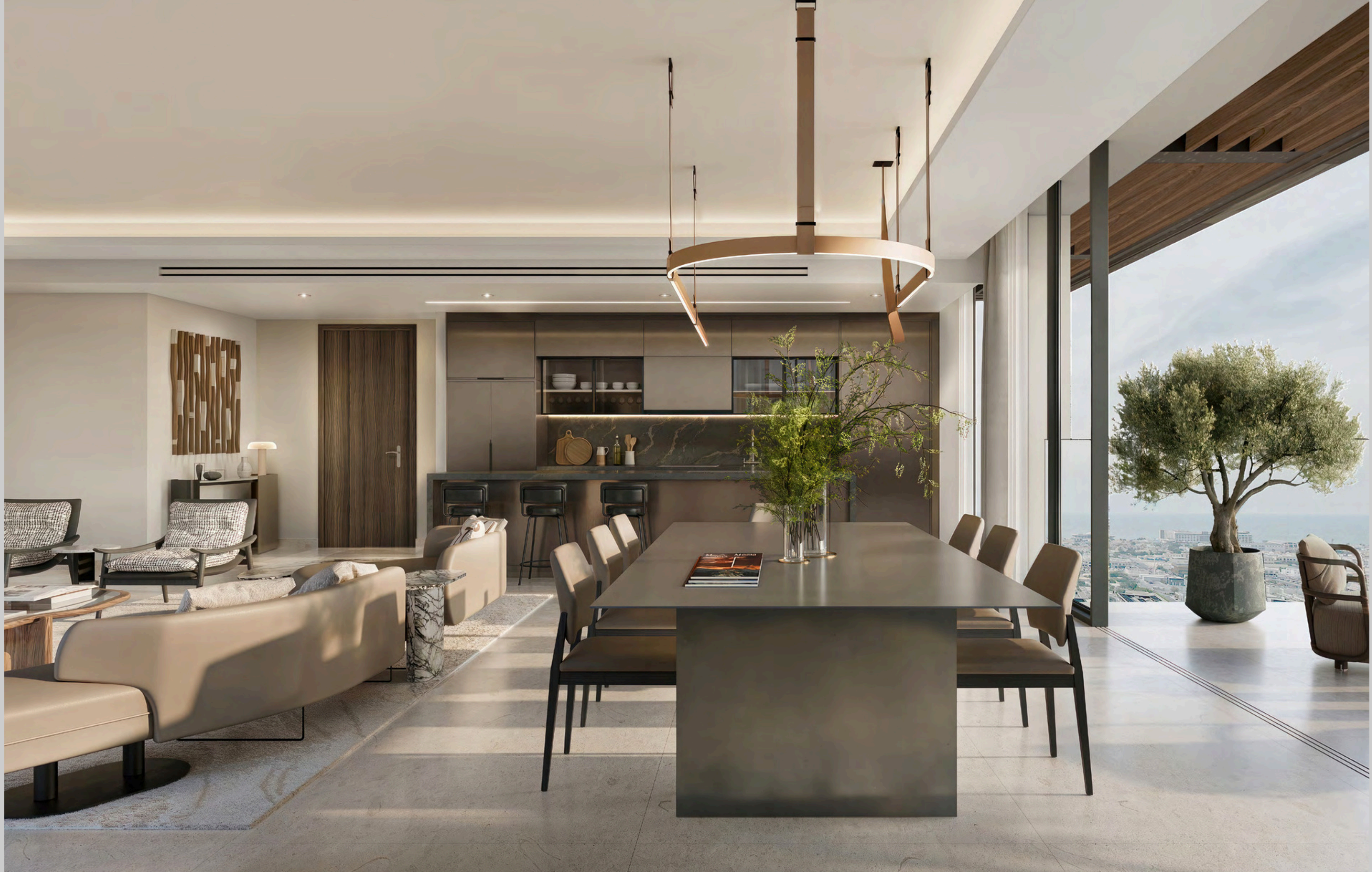
CRESTLANE 3 1 TO 3-BEDROOM