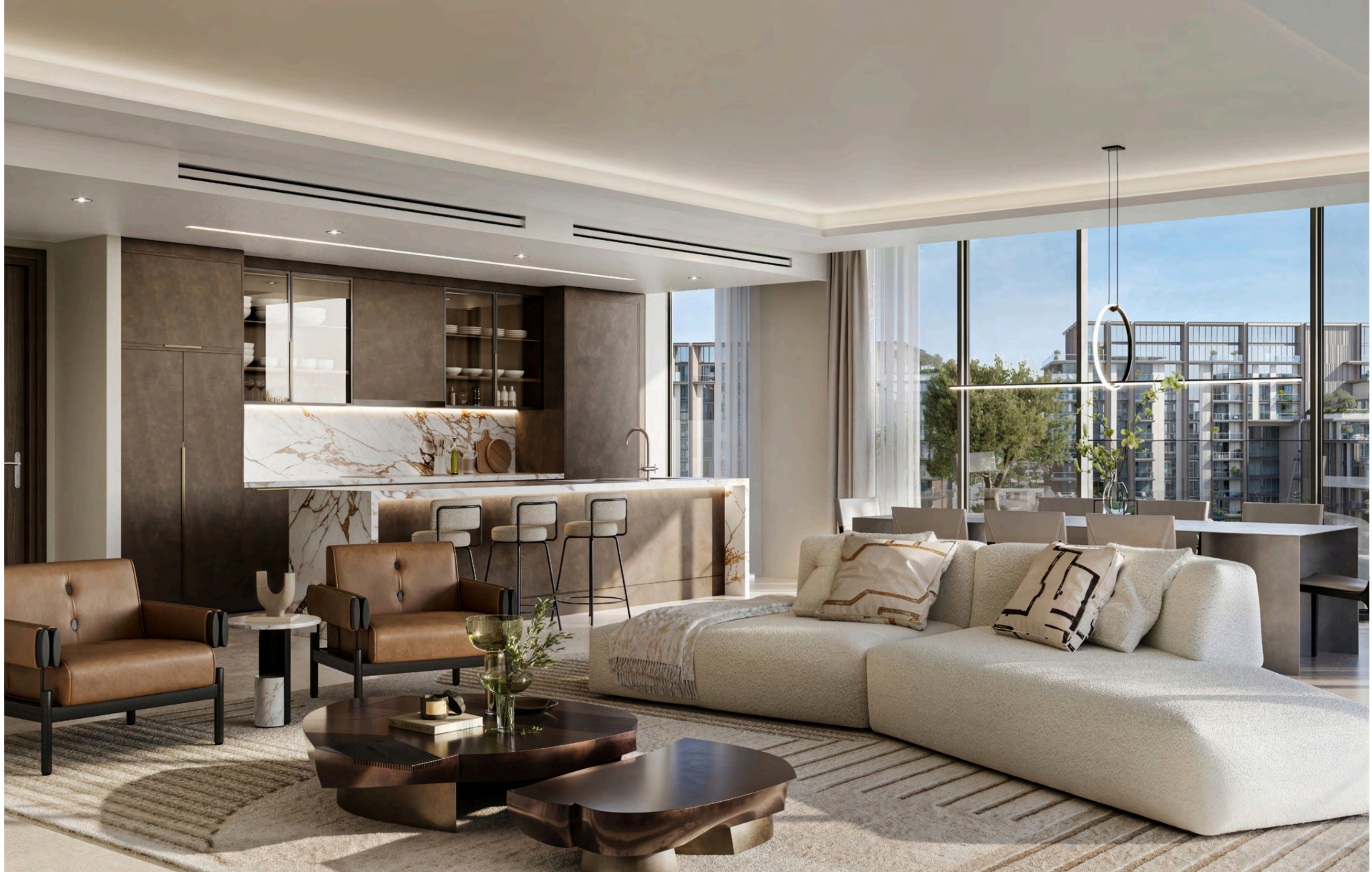
CRESTLANE 2 1 TO 3-BEDROOM