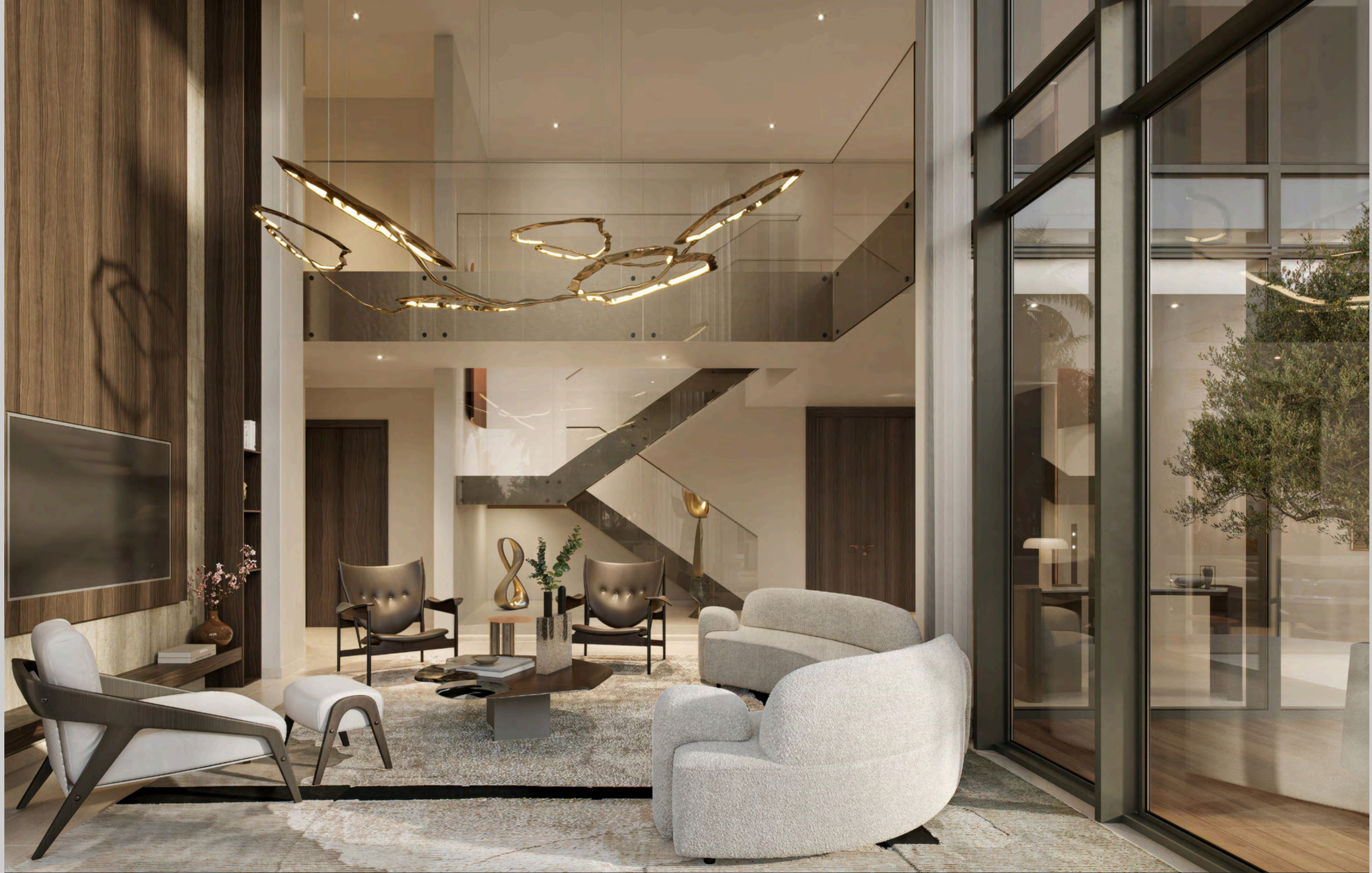
CRESTLANE 3 4-BEDROOM DUPLEXES