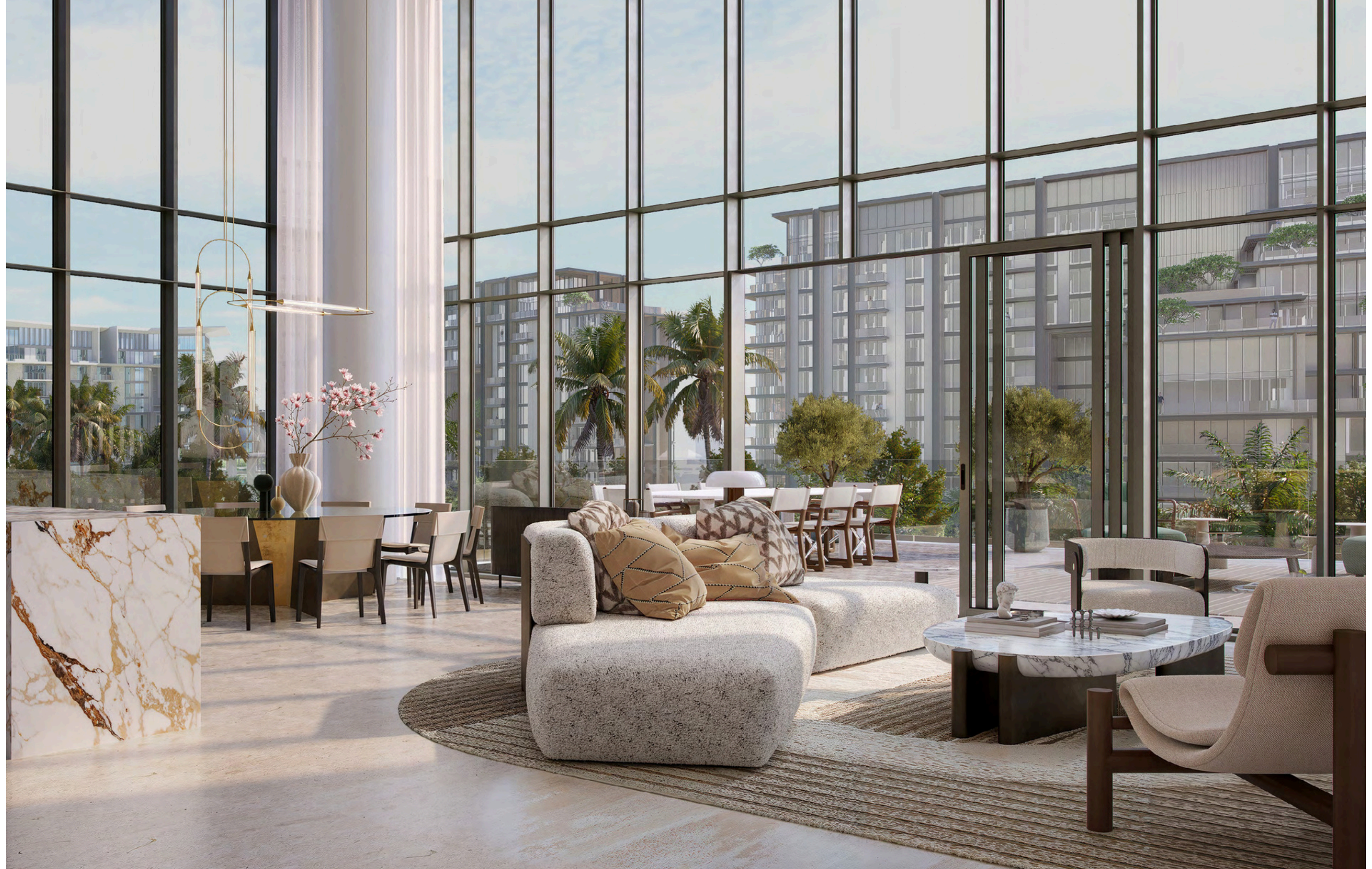
CRESTLANE 2 3 TO 4-BEDROOM