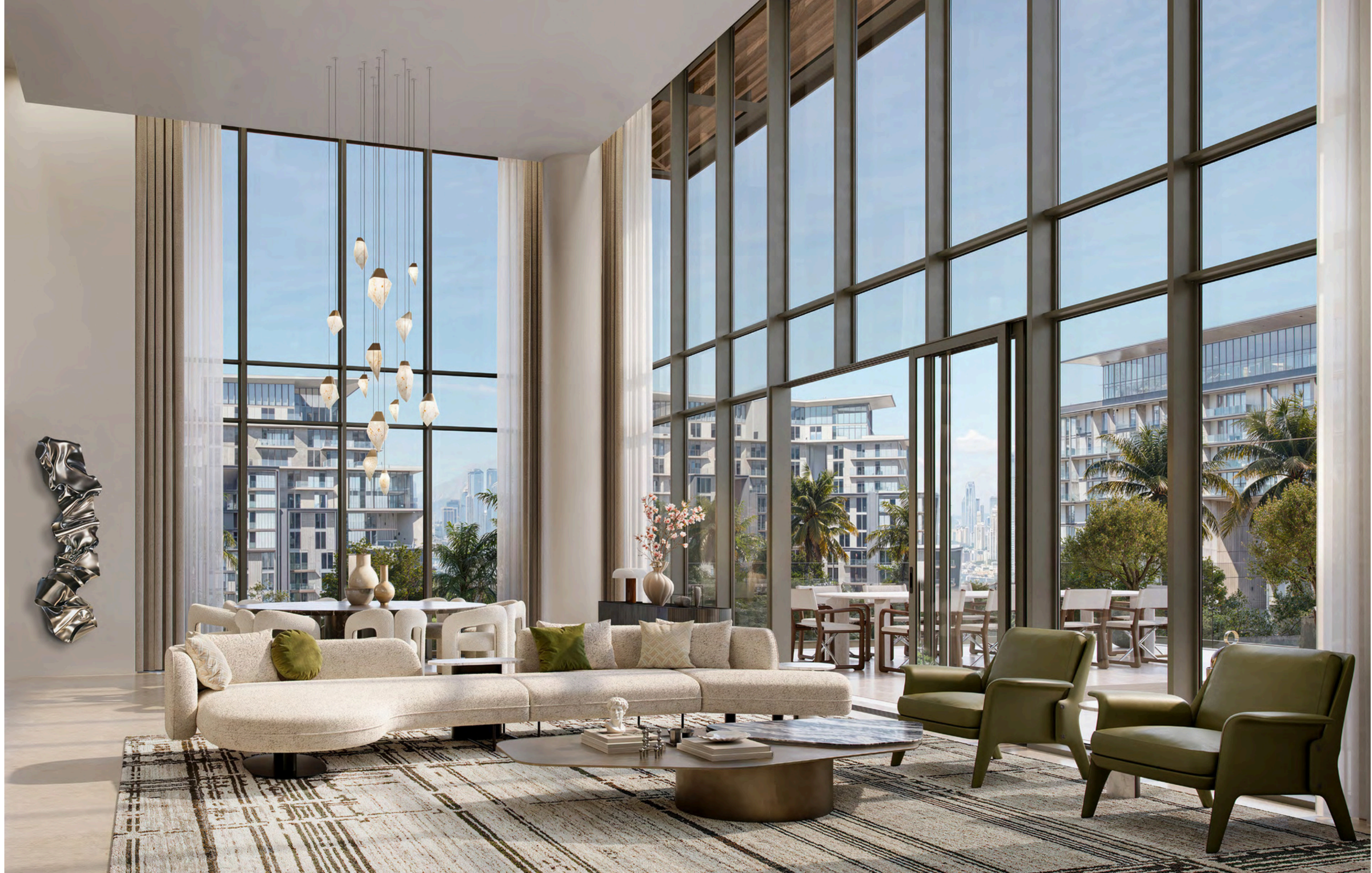
CRESTLANE 3 3 TO 4-BEDROOM