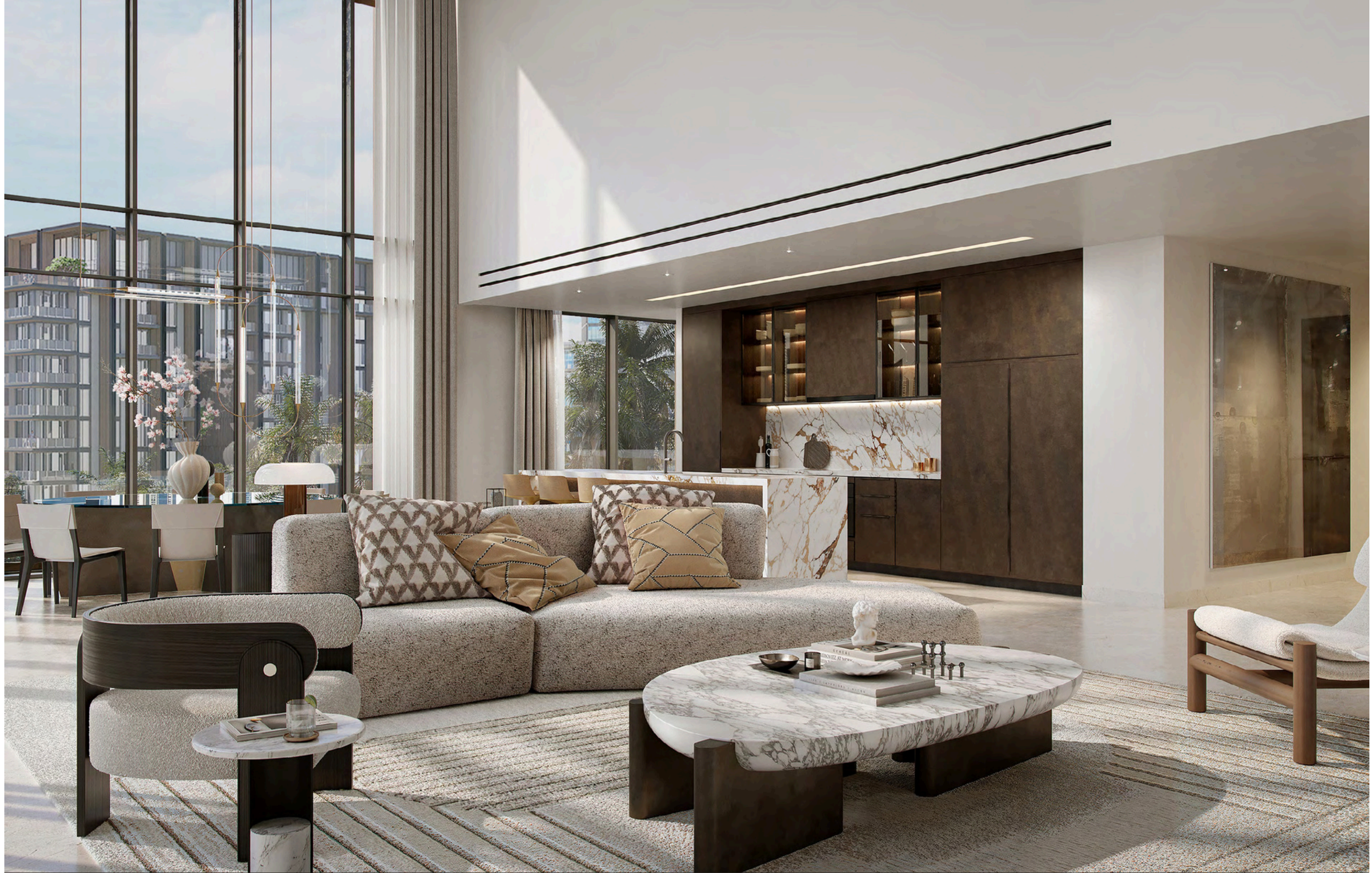
CRESTLANE 2 3 TO 4-BEDROOM