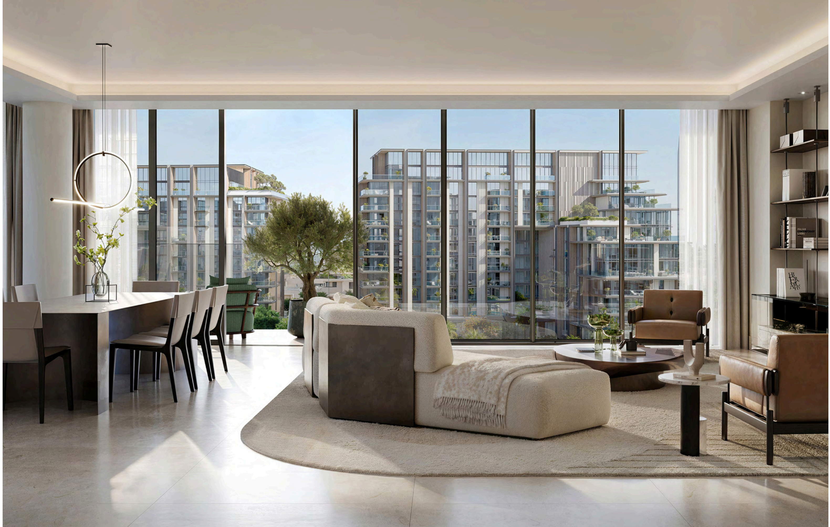
CRESTLANE 2 1 TO 3-BEDROOM